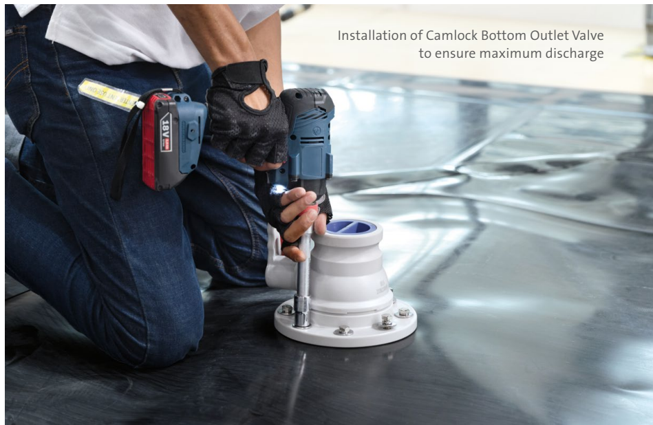
Installation of Camlock Bottom Outlet Valve to ensure maximum discharge